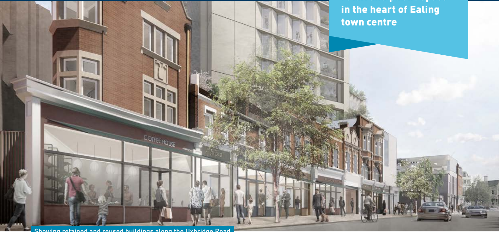
Showing retained and reused buildings along the Uxbridge Road