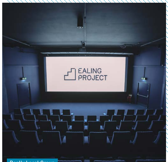
Really Local Group

For further information about What's On in Ealing Broadway Shopping Centre, you can visit: https://www.ealingbroadwayshopping.co.uk/whatson