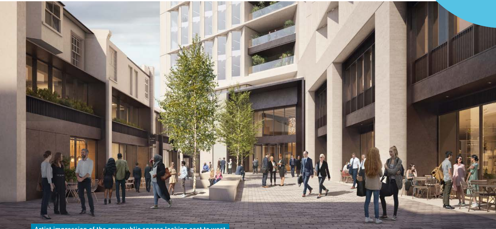
Artist impression of the new public spaces looking east to west

British Land is one of the UK's leading developers and investors. We became owners of Ealing Broadway Shopping Centre in 2013 and purchased the Broadway Connection site in 2017. We are committed to leaving a lasting, positive legacy here and have already invested heavily into improving local sustainability and providing support for a range of different organisations and activities that benefit the area.